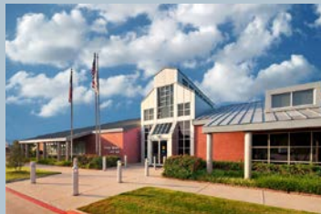
Town Hall 2121 Cross Timbers Flower Mound, Texas