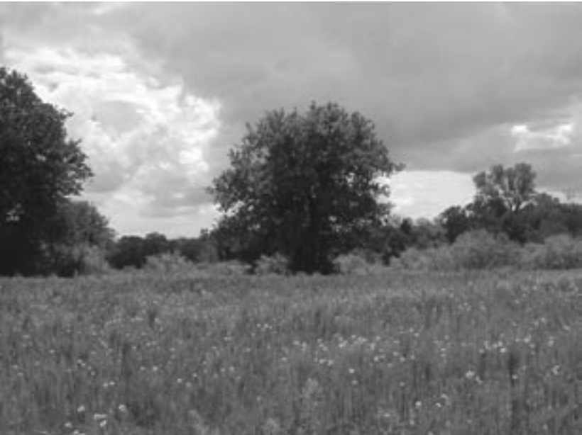
photo: Citywide Trail System, Flower Mound.

The trail dedication ordinance is working well for Flower Mound. Developers have constructed over half of the trail system at no cost to the town or existing residents, and the ordinance ensures that more trails will be constructed as land is developed. If the ordinance has a disadvantage, it is that gaps in the network remain until development occurs.