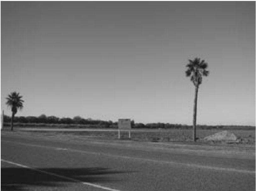
photo: Bentsen Palm Village and the World Birding Center, Mission.

Texas Parks and Wildlife and the U. S. Fish and Wildlife Service desire to attain many more acres of land to create a contiguous habitat corridor along the Rio Grande. Working with private companies allows these agencies to acquire land in innovative ways without dipping into their limited budgets.