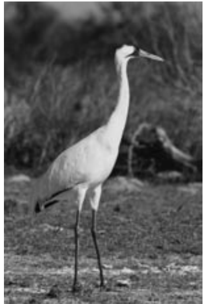
photo: Crane House Bed & Breakfast Aransas County.

Heroes or not, the sale of the salt marsh and the agreement to permanently protect the remainder of the property from development creates roughly 800 more acres that can be used by the Whooping Crane and many other species of wildlife for centuries to come.