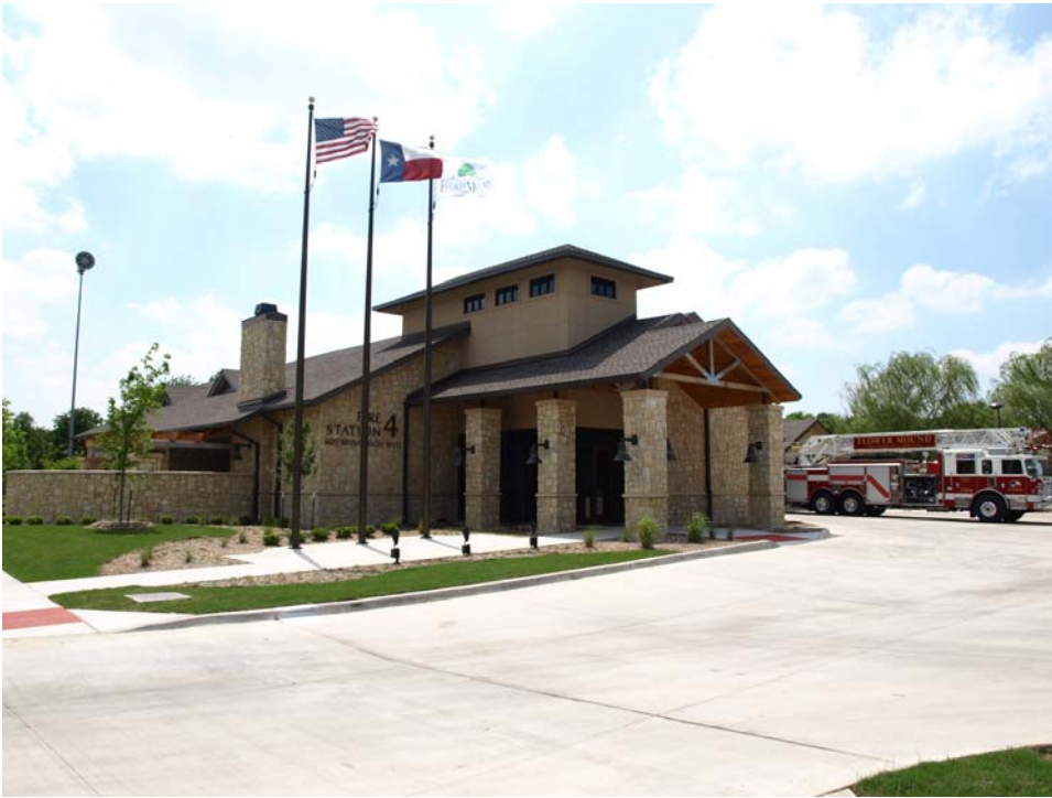
Fire Station # 4 (above)