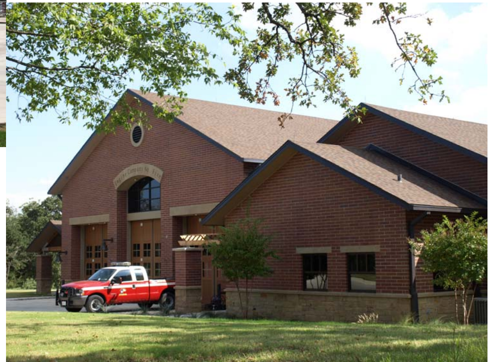
Fire Station # 5 (below)